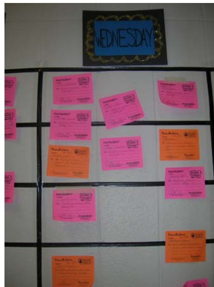
Praise notes are displayed on a large staff in the music wing.

A peace builder is a person that shows respect for others. They also make the community better by noticing people's hurts and praising people. Now our school has a new thing called praise notes. A praise note is when you do something good and the teacher notices you. You can also give praise to a friend by showing peers what you like about them